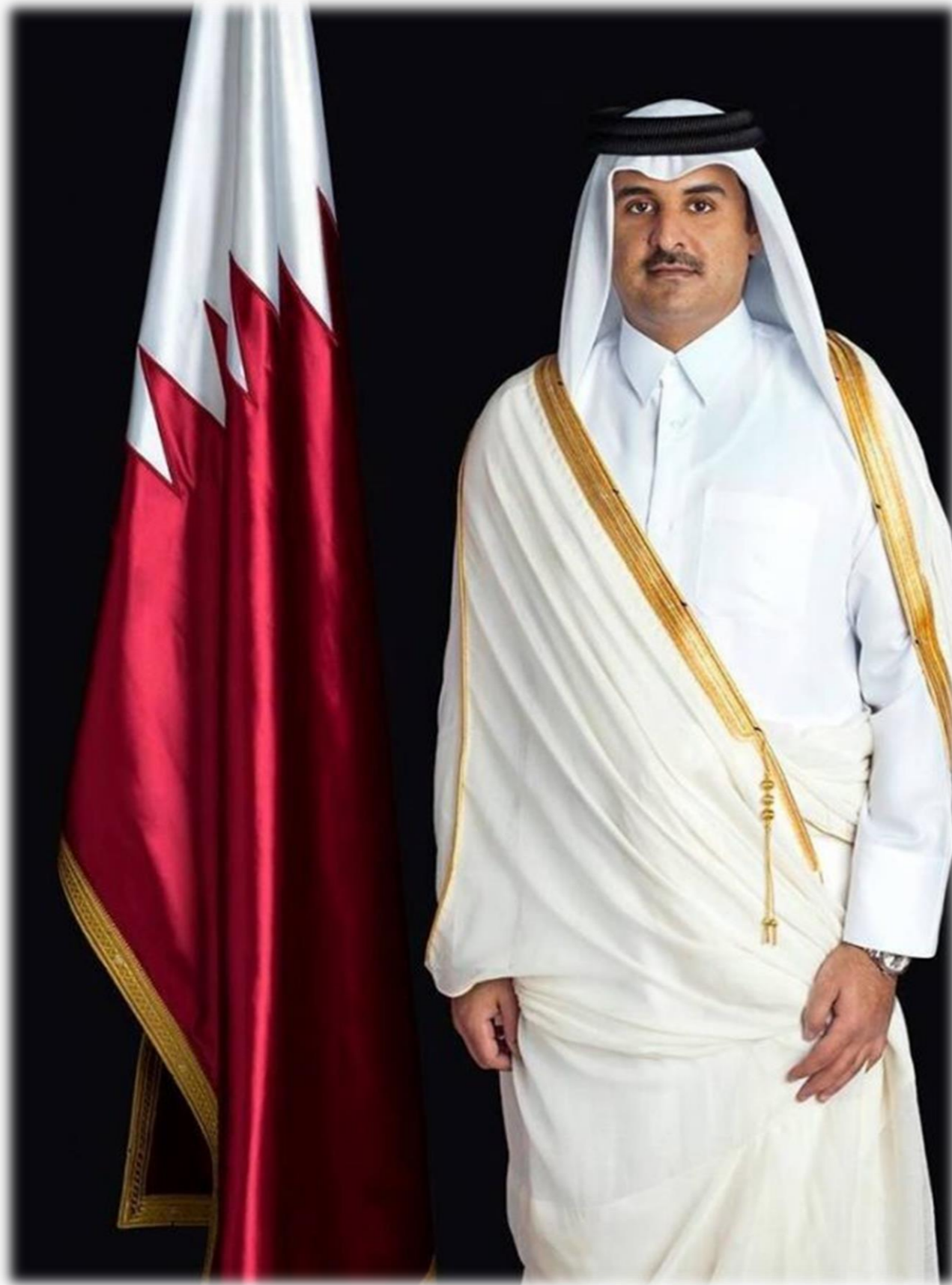
HH Sheik Tamim Bin Hamad AL Thani Amir of Qatar

The State of Qatar will hold its first parliamentary elections, the Shura Council , in October 2021, His Highness the Amir of Qatar, Sheikh Tamim bin Hamad Al Thani, announced during his opening speech at the 49th ordinary session of the Consultative Council.