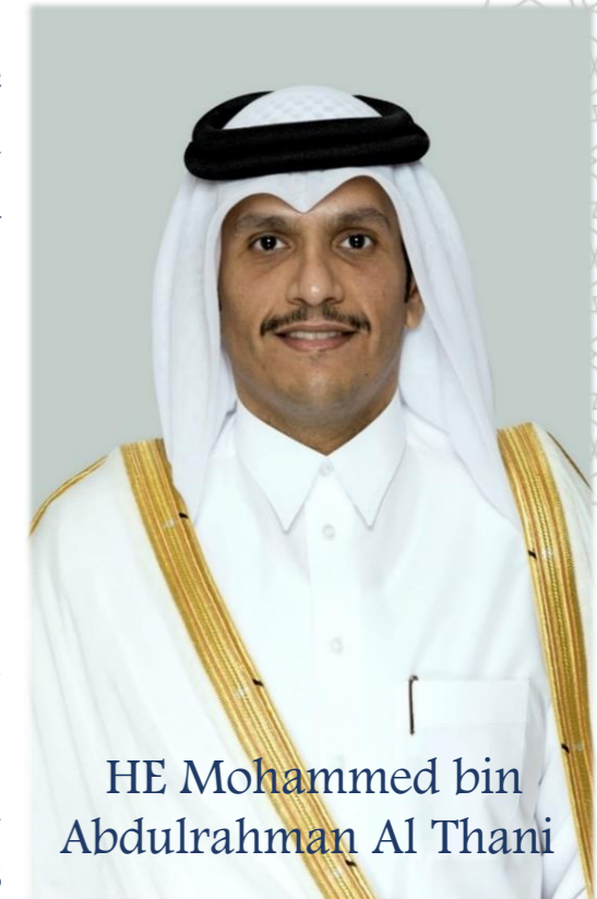
HE Mohammed bin Abdulrahman Al Thani Foreign Minister

HE stressed the importance of fair and equitable access to safe and effective vaccines to control the pandemic. To this end, the State of Qatar has allocated $20m to the Global Alliance for Vaccines and Immunization, to enhance research and clinical tests for vaccines and drugs. Find Further details about both topics by clicking on the pictures