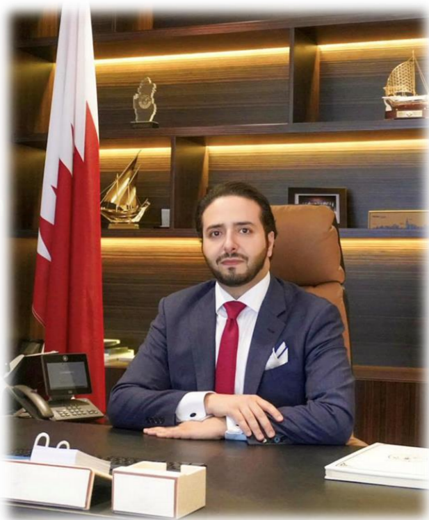
Mohammed Sultan Al Kuwari Consul General