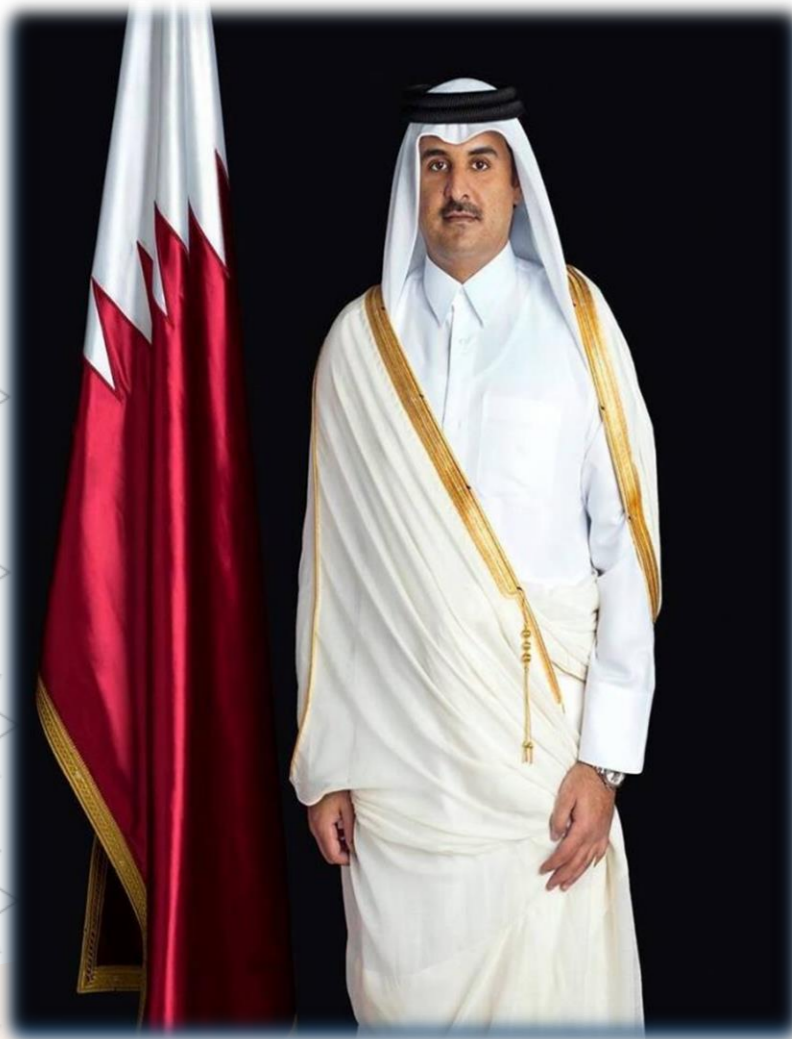
HH Sheik Tamim Bin Hamad AL Thani Amir of Qatar