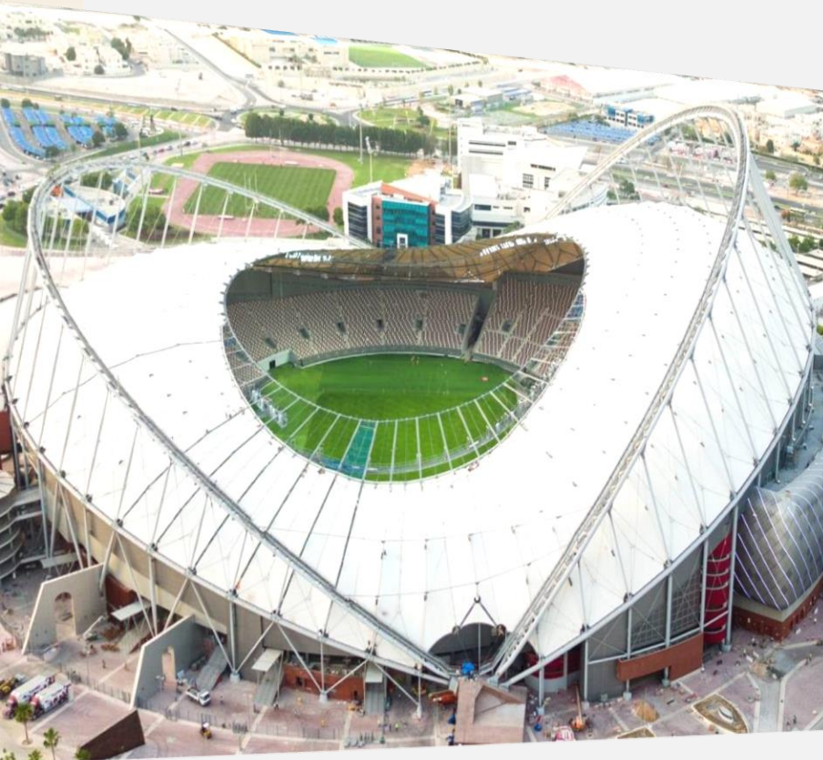
Khalifa International Stadium