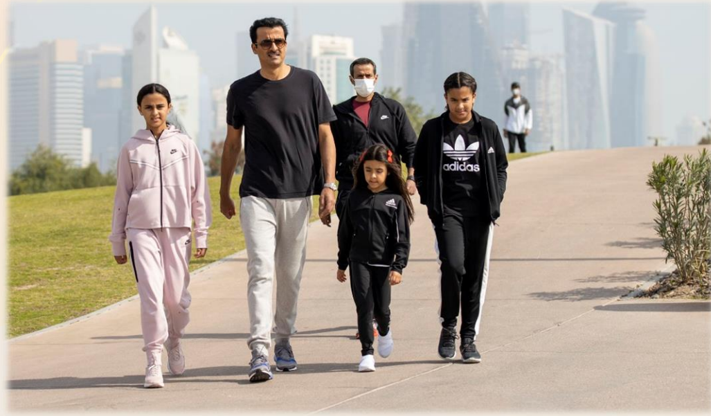
H H Sheikh Tamim bin Hamad Al Thani, Amir of Qatar celebrating Qatar National Sport Day 2021 with his daughters

National Sport Day is celebrated annually in Qatar every second Tuesday of February and its main objective is to promote and support a healthy lifestyle for Qatar's residents.