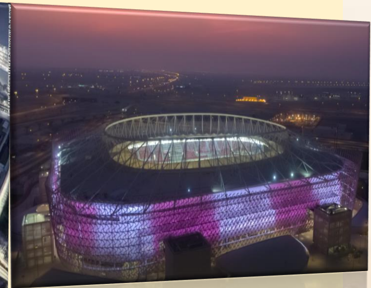
Ahmad Bin Ali Stadium

Education City Stadium was inaugurated in June 2020 during a virtual event that paid tribute to front-line healthcare workers during the coronavirus pandemic. It will host matches up to and including the quarter-final stage during Qatar 2022.