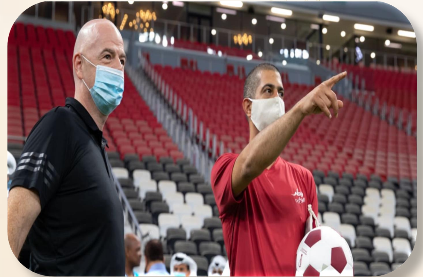
“FIFA president praises Qatar’s World Cup preparations during his first visit to Al Bayt Stadium”

The stadiums, as well as non-competition venues and other infrastructure the SC and stakeholders are meant to deliver will contribute to a compact and connected FIFA World Cup with sustainability and accessibility at its heart. After the tournament, the stadiums and surrounding precincts will become vibrant hubs of community life – an integral part of the legacy being built in Qatar.