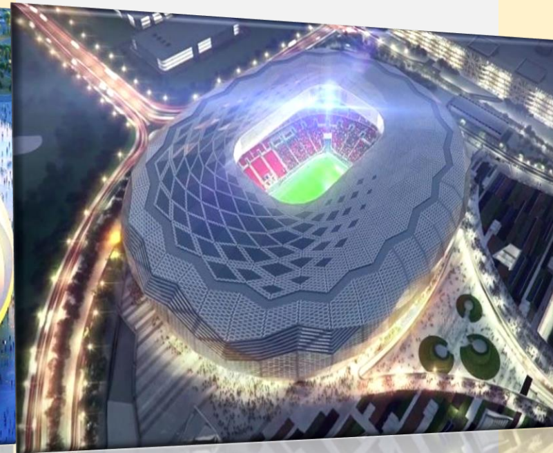
Education City Stadium

Al Janoub Stadium was the first Qatar 2022 tournament venue to be built from scratch and will host matches up to and including the round of 16 during Qatar 2022.