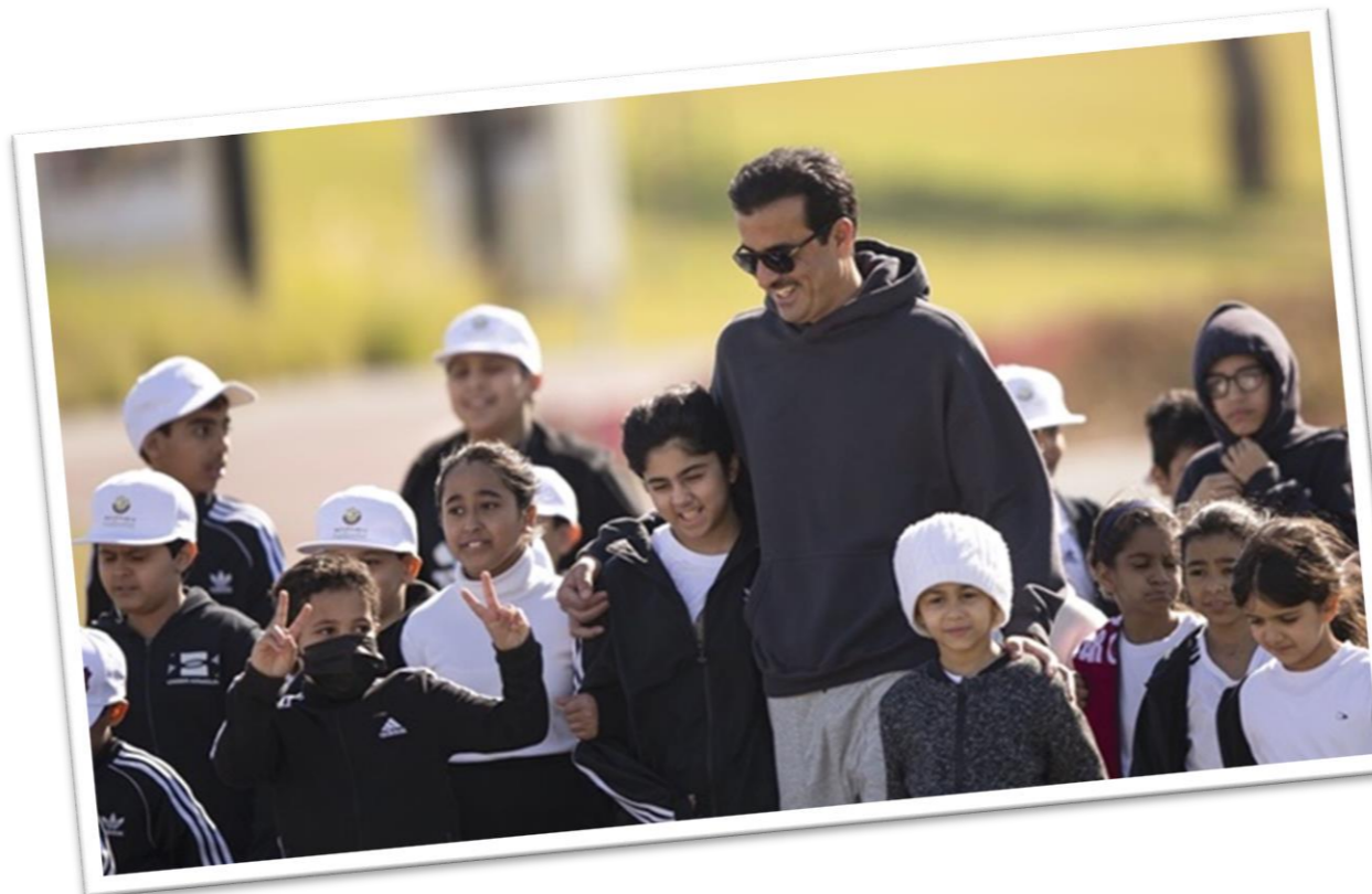
The Amir of the State of Qatar, H.H. Sheikh Tamim bin Hamad Al Thani marking Qatar National Sport Day on February 8 th 2022 in Doha, Qatar

The aim of Qatar National Sport Day is to promote sports and a healthier, more active lifestyle to both younger and older generations in Qatar and beyond. It brings communities together through sport and its principles of team building, inclusion, unity and participation. Qatar is celebrating its National Sport Day this year adhering to social distancing regulations and different public health measures.