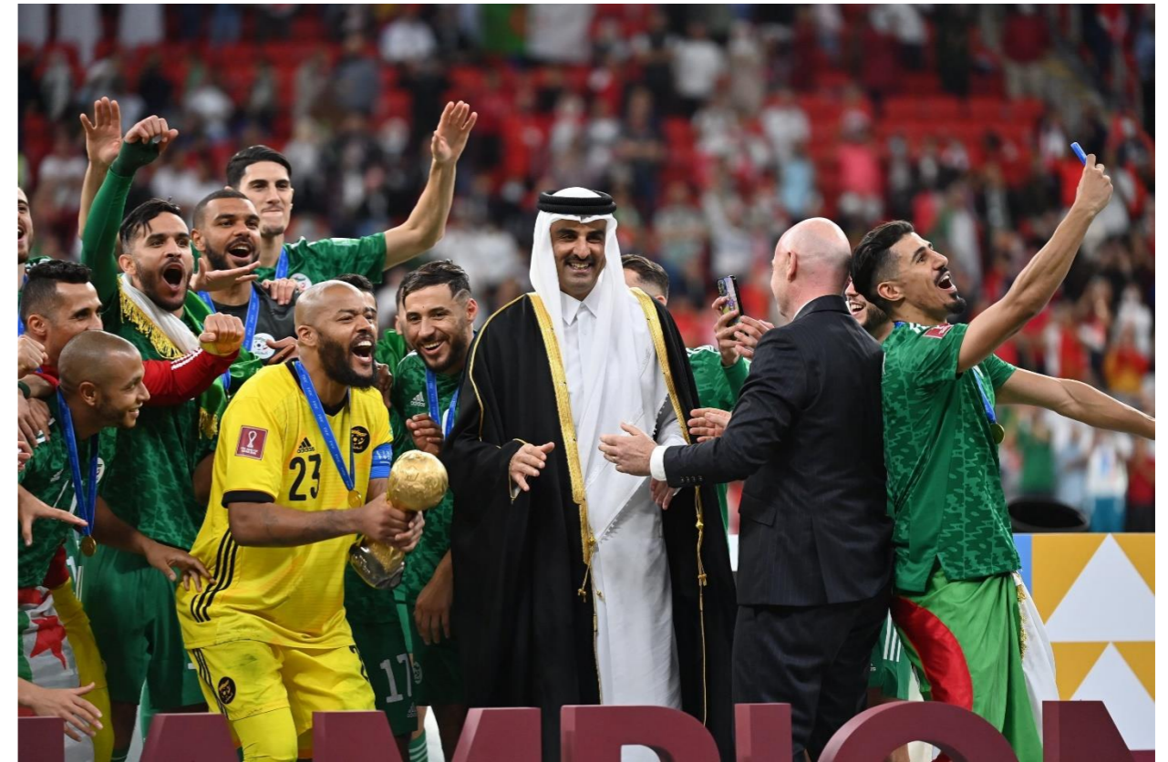
The Amir of the State of Qatar, H.H. Sheikh Tamim bin Hamad Al Thani attended the tournament's closing ceremony at Al Bayt Stadium and handed Algeria the Cup after their final victory over Tunisia.

The Qatari National Team finished in third place after defeating Egypt 5-4 in penalties, which was held at 974 Stadium. Akram Afif, the star of the Qatari team, won the bronze ball as the third-best player in the tournament, which witnessed an unparalleled success and came as a rehearsal before the FIFA World Cup Qatar 2022.