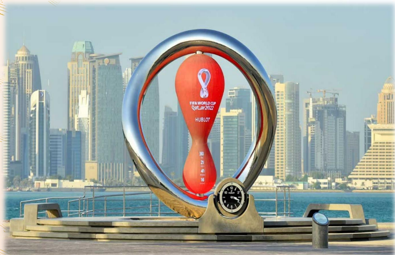
Official countdown clock showing remaining time until the kick-off of the World Cup 2022, in Doha, Qatar